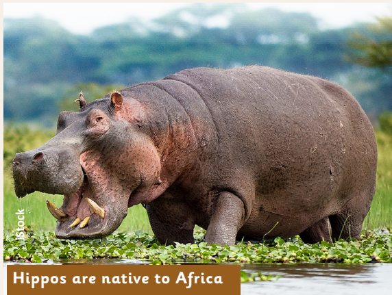
Hippos are native to Africa