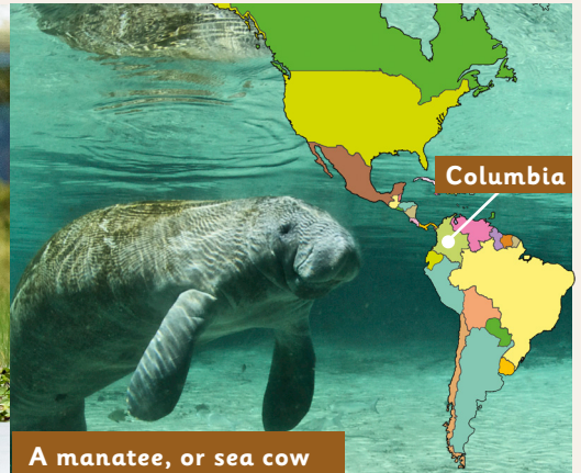
A manatee, or sea cow

EXPERTS have said that hippos living in Colombia need to be culled as they are damaging local wildlife and the environment.