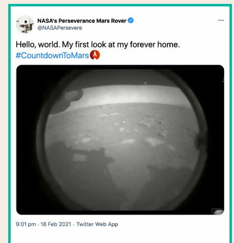
Perseverance's first image of Mars, which was posted on Twitter