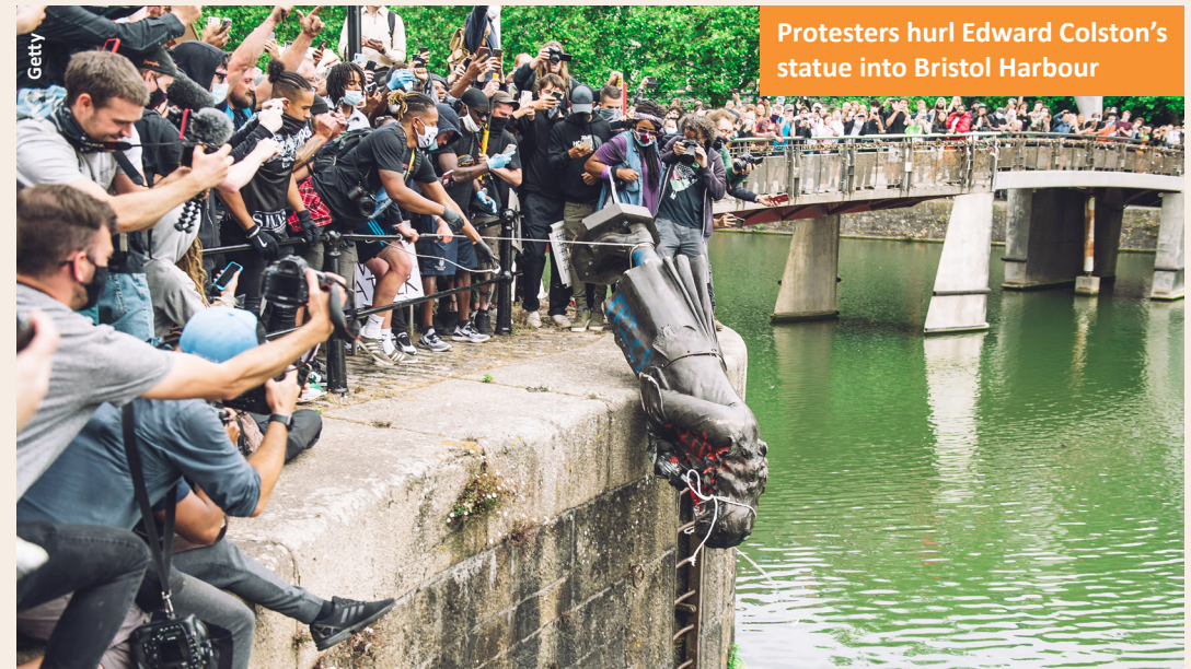
Protesters hurl Edward Colston's statue into Bristol Harbour

He gave a lot of money to churches, hospitals and schools in Bristol. His statue has stood in the city centre since 1895, but many people have been unhappy that he is still honoured in this way. The Mayor of Bristol said the Edward Colston statue was an "insult" to black people. The statue was thrown into Bristol Harbour.